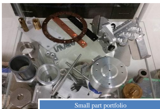
Small part portfolio