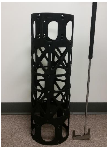
Golf club for scale!