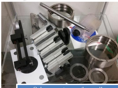
Order one part or one thousand!