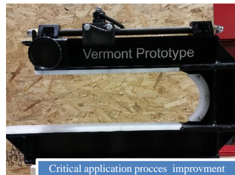
Critical application process improvement