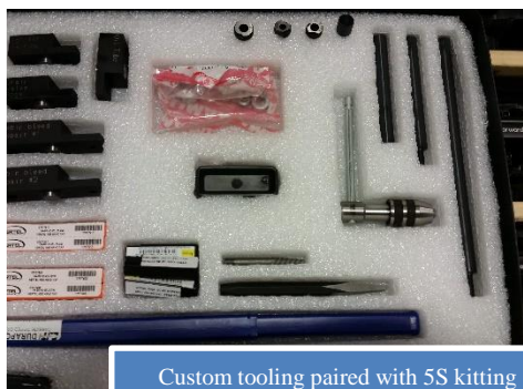
Custom tooling paired with 5S kitting