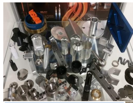
All materials/ coatings !